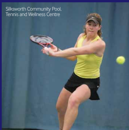
Silksworth Community Pool, Tennis and Wellness Centre