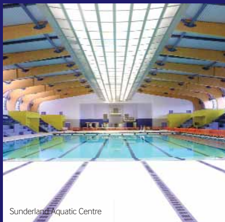
Sunderland Aquatic Centre

Millennium Way Sunderland SR5 1SU Tel: 0191 551 5000 or email tours@saafc.com for guided tours Opening Hours: Please phone or email to make a booking Admission: Adults £10, concession £5, family ticket £25. Group rates available. www.saafc.com