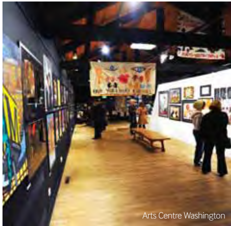
Arts Centre Washington

Sunderland boasts a vast array of attractions, outdoor spaces and sporting activities for all tastes and abilities.