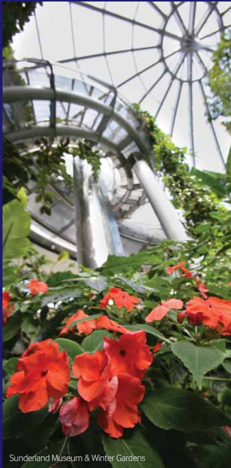
Sunderland Museum & Winter Gardens

High Street West Sunderland SR1 3EX Tel: 0844 847 24 99 Opening Hours: Box Office Mon-Sat 12noon-6pm Admission: Varies depending on the production www.sunderlandempire.org.uk