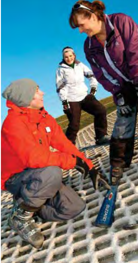
Silksworth Sports Complex and Ski Slope