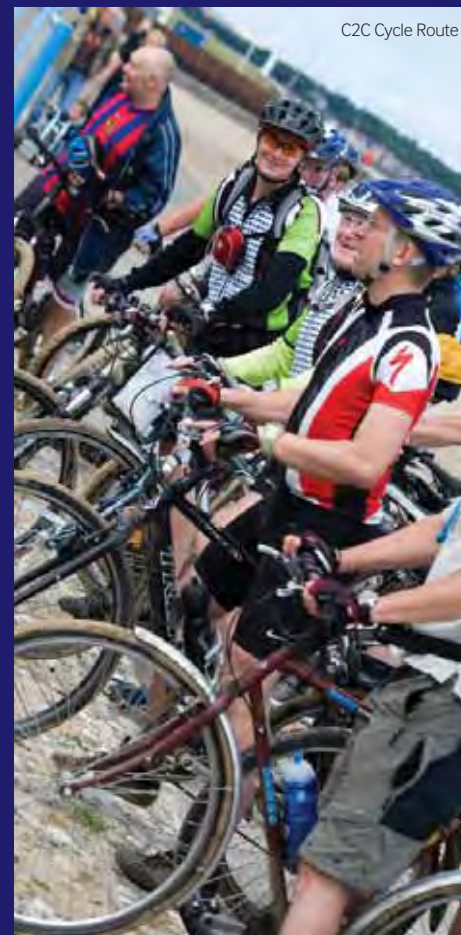
C2C Cycle Route