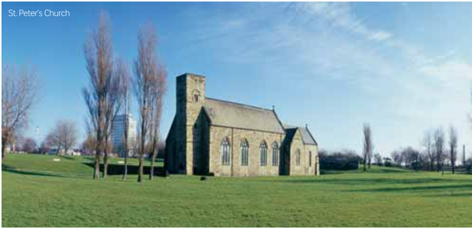
St. Peter's Church