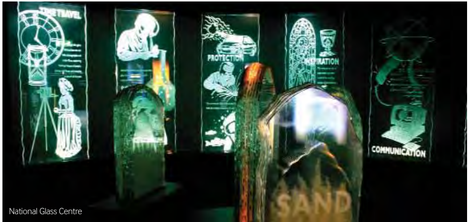
National Glass Centre

A number of Sunderland's heritage attractions also have varying opening times, so please telephone to check times before visiting.